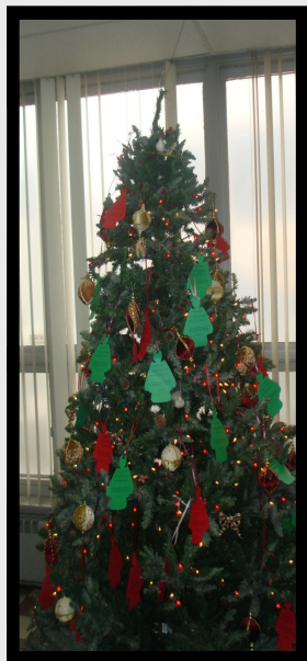
Angel Christmas Tree

Have a Blessed Christmas & New Year From BCA!